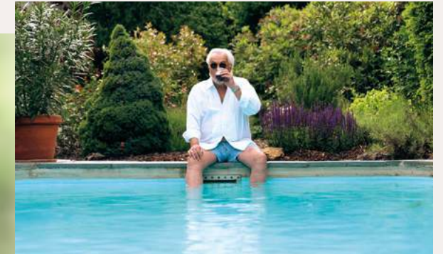
Perfect for enjoying chilled coffee, iced coffee or coffee cocktails