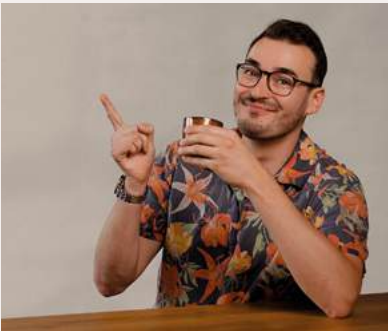
This is what the Aroma Balance System produces from our Espresso Milano, for example:

us that everyone gets their very favorite coffee with their NIVONA.